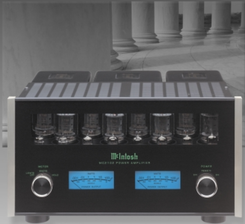
MC2102 Tube Power Amplifier