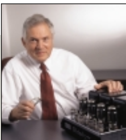
Sidney A. Corderman

DRIVER STAGE. The driver stage is fed by the 12AX7A input/phase inverter. A resistance-capacitance step network couples these stages and minimizes low-frequency phase shift. The phase inverter has no coupling capacitors so no additional low-frequency phase shift is introduced.